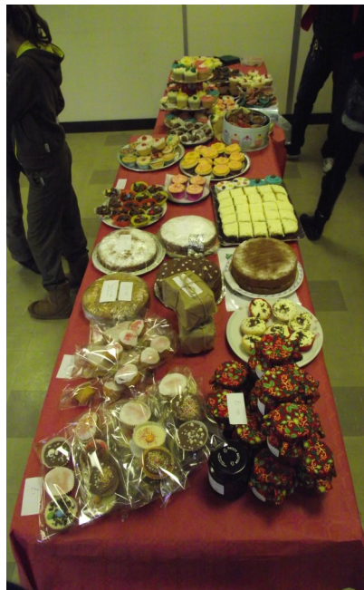
The Brownie Cake Stall

It was really great to have our special guests, Elmlea Junior School Choir, who were able to sing for us again this year. Scouts kept themselves warm by selling roasted chestnuts outside, whilst Cubs, Guides and Brownies sold their wares indoors.